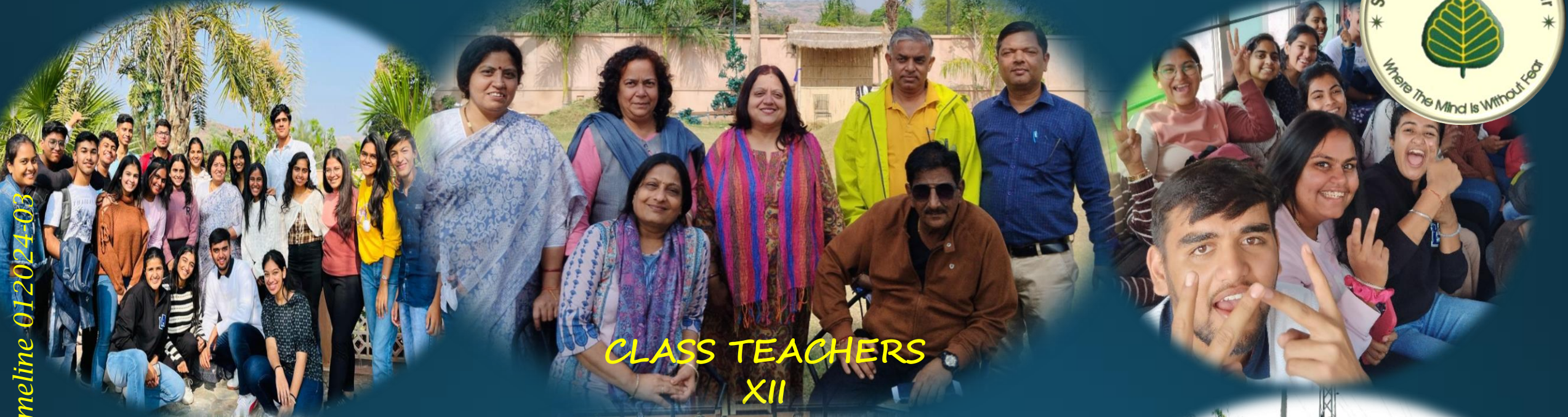
CLASS TEACHERS XII